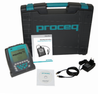
353 10 050 basic unit