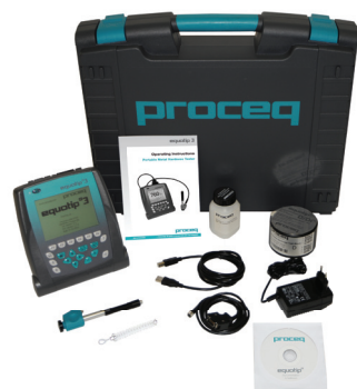
353 10 100 unit D

Equotip3 indicating device, AC adapter, carrying case, USB-cable, Equotip CD, operating instructions and quick reference guide. The customer needs to buy the appropriate impact device and test block in addition to the Equotip 3 basic unit