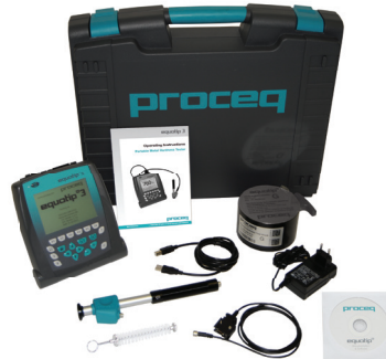
353 10 300 unit G