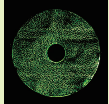
After (LY-20 Conc.)