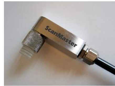
ScanMaster PA Probe

ScanMaster UT/x uses 15 MHz PA matrix transducer incorporating 61 separate elements with a 1mm pitch. It includes a built-in water path for ultimate UT performances and flexible membrane to compensate different weld indentations