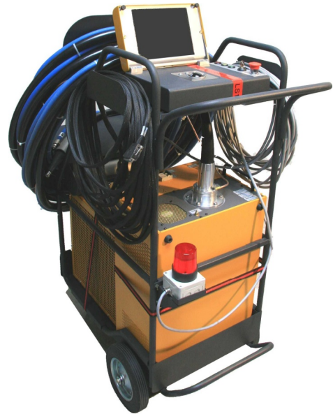
XMD 160 with a 25m HV cable

A lot of handy features have been included: among these fully automatic preheating process,